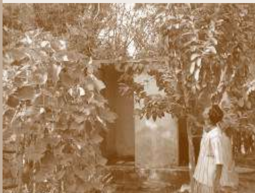
▲ More than just toilet and bathing room. Waste water from the bathing area tends kitchen gardens. Banana and papaya grown near soakpits to keep the pits dry – Asuramunda, Bolangir

In over a 100 villages across Orissa, poor communities have come together to establish, operate and manage their own water supply and sanitation systems. While doing so, they have created financial and institutional mechanisms that will ensure that these services and facilities are available for all times to come, most importantly, to all families in the village without exception. The facilities were created with their own efforts and resources, with some assistance from external agencies. The Corpus Fund of 105 villages, raised entirely by contributions by each family in the villages, amounts to Rs.11 million. Own funds of the 257 Self Help Groups is Rs.2.3 million and they have accessed in excess of Rs.1 million as loans.