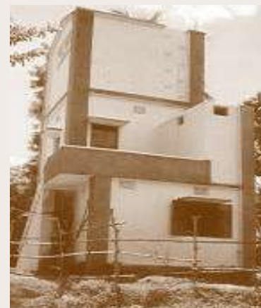
▲ The water tank is a symbol of dignity and pride. Piped water is available to all families all through the year.

All adults in these villages have now begun to play an influential role not only in their own villages, but also in the Panchayats that they are part of. They have also been able to access government funding and resources from financial institutions for other development activities as well, like building of community halls, roads, pond development, etc. Together these communities have also been working towards effective functioning of schools and health services in the villages. Over Gram Vikas has been facilitating these processes under the umbrella of the Rural Health and Environment Programme (RHEP).